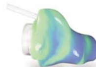
EARMOLD COLORS: AVAILABLE IN SOLID OR SWIRLED COLORS. SEE WEBSITE FOR SAMPLES.